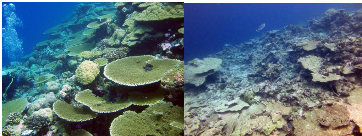
365 366 Figure 1: Reef slope on Salomon atoll, Chagos Archipelago, before and after the mass mortality caused by warming in 367 2015

361 The scenario of fewer corals producing fewer larvae, more turbid water in some areas and less substrate available for settlement 362 is a classical positive feedback or TP situation. These factors all act synergistically in a direction that inevitably leads to an 363 ever more impoverished reef system. Recovery from this will require a prolonged period without heat stress and a gradual 364 removal of the vast volumes of sediment and rubble left from previous bleaching events (Sheppard and Sheppard, 2019).