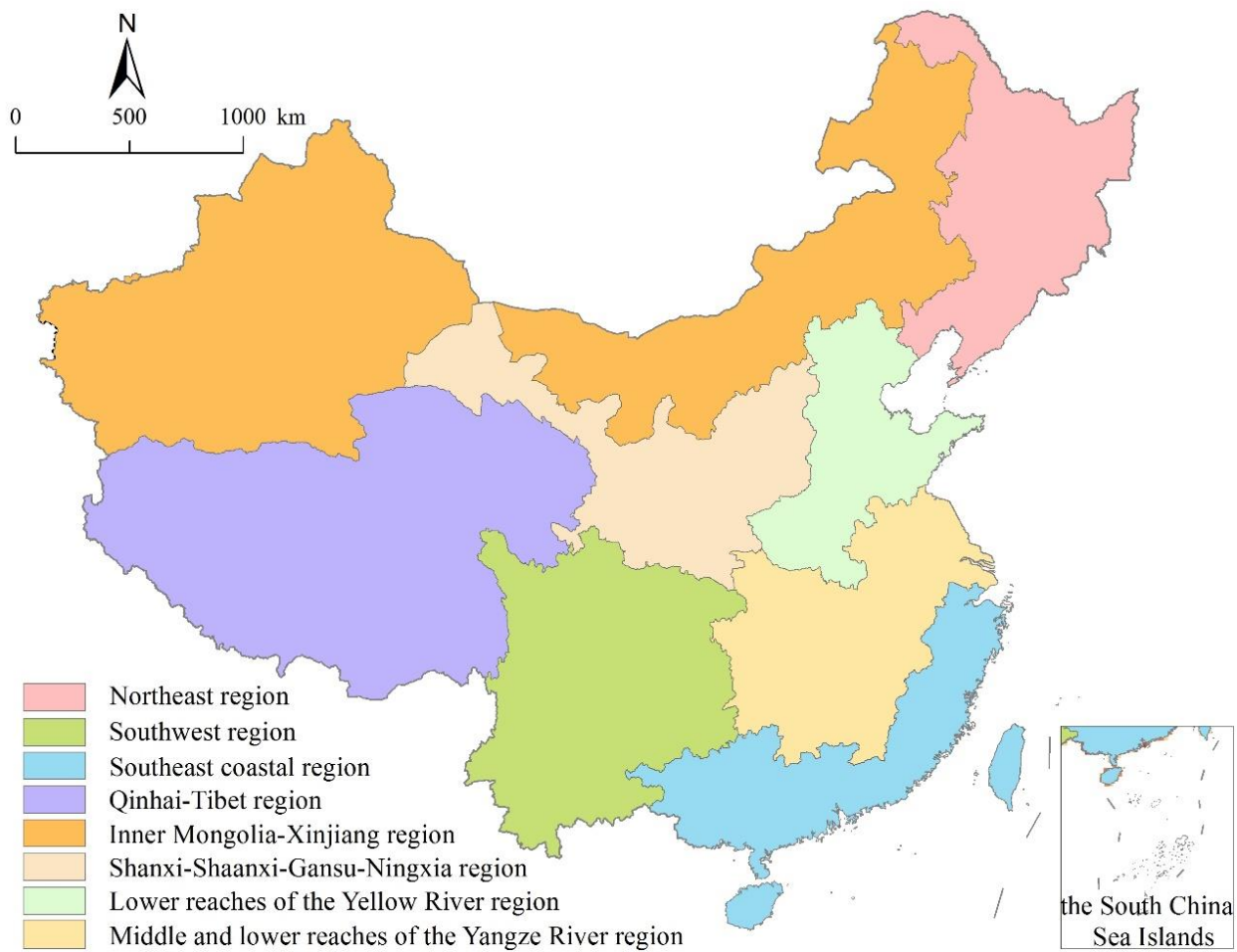
Fig. S1 Regional divisions of China's population