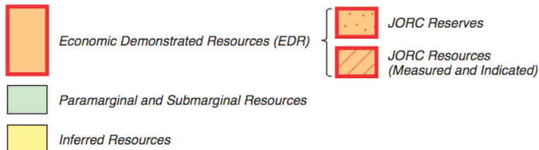
Figure 2: Correlation of Australia's national mineral resource classification system with the UNFC system (Geoscience Australia, 2014, p. 172), criteria (E) economic and social viability, (F) project status and feasibility (F), and (G) geologic knowledge.